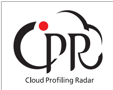
Full color positive