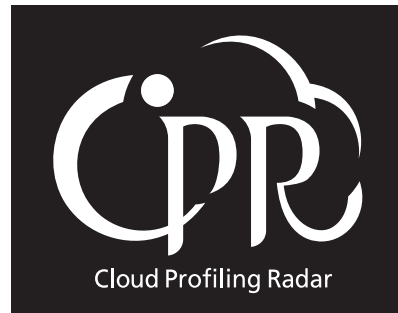
Full color Negative