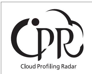
Black & White Positive